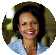
Condoleezza Rice, Stanford University